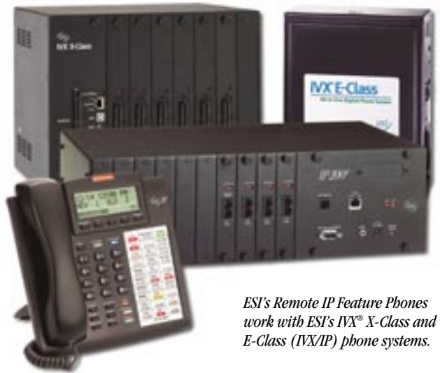
ESI's Remote IP Feature Phones work with ESI's IVX® X-Class and E-Class (IVX/IP) phone systems.

Temporary field offices — If your company periodically establishes temporary remote office locations with a data connection to the main office, now that same data pipeline can also carry your interoffice phone traffic. Simply program the Remote Phone and plug it into the field office's high-speed data connection, and you've got a fully-functional extension for as long as you need it. Down the street or hundreds of miles away, your field offices can be as accessible as the person in the next room.