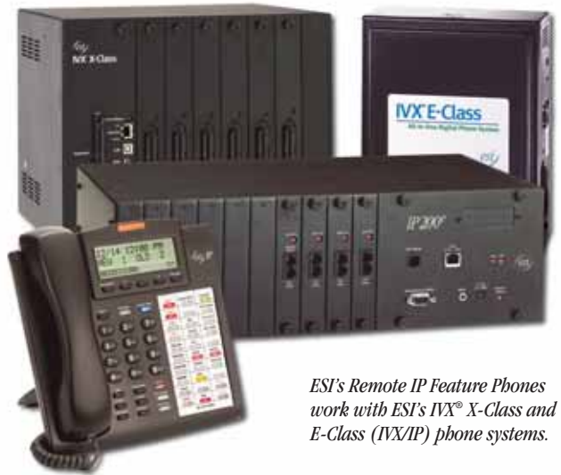
ESI's Remote IP Feature Phones work with ESI's IVX® X-Class and E-Class (IVX/IP) phone systems.

Temporary field offices — If your company periodically establishes temporary remote office locations with a data connection to the main office, now that same data pipeline can also carry your interoffice phone traffic. Simply program the Remote Phone and plug it into the field office's high-speed data connection, and you've got a fully-functional extension for as long as you need it. Down the street or hundreds of miles away, your field offices can be as accessible as the person in the next room.